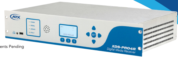
XDS-PRO4R (front view)