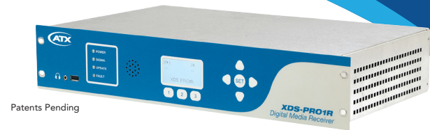
XDS-PRO1R (front view)

The XDS-PRO1R digital audio receiver allows radio stations to receive audio broadcasts from distributed satellite or IP networks for live broadcasting or storage for later play-out. The unit provides targeted advertising capabilities, allowing radio networks to play localized ads & other content relevant to specific locations. In addition to copy splitting, the cost-effective XDS-PRO1R supports audio insertion & digital live recording with playback to delay time zone feeds. It also has advanced station automation interfaces via IP, RS-232, relay closures, OPTOs & commands to seamlessly interface with automation systems. Finally its advanced scheduling capabilities allow networks & stations to automatically switch between live & pre-recorded channels & programs.